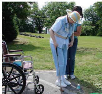
Truslow Adult Day Center participant hits a golf ball with staff member's support.