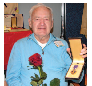
One of 10 veterans honored during Veterans Appreciation Day at Truslow Adult Day Center, shows his Purple Heart.

“I've been very lucky and happy here...really like coming very much.”